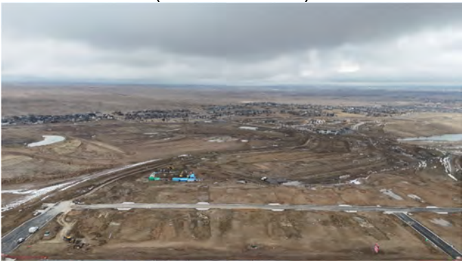
Trailstone (View: North)