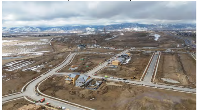
Trailstone Model Homes (View: Northwest)