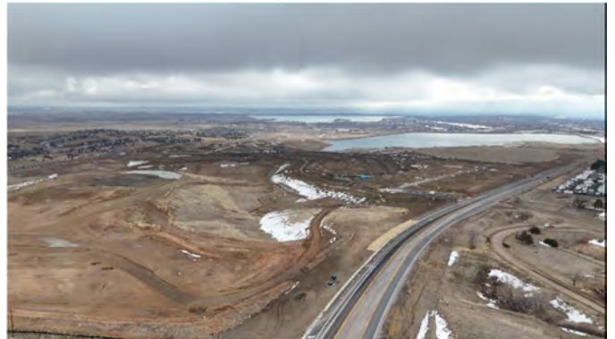
Trailstone along Highway 72 (View: Northeast)