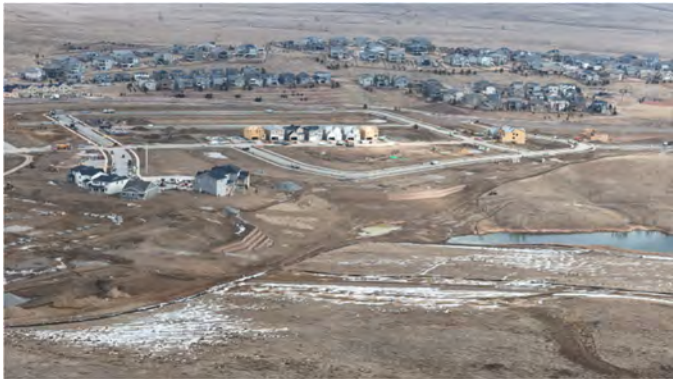
Trailstone Model Homes (View: Northeast)