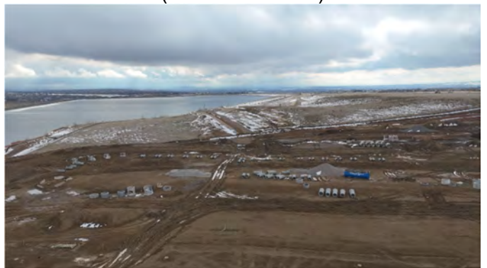
Drainage Utility Construction (View: East)