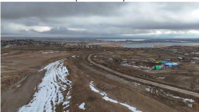
Salvia Street (View: Northeast)