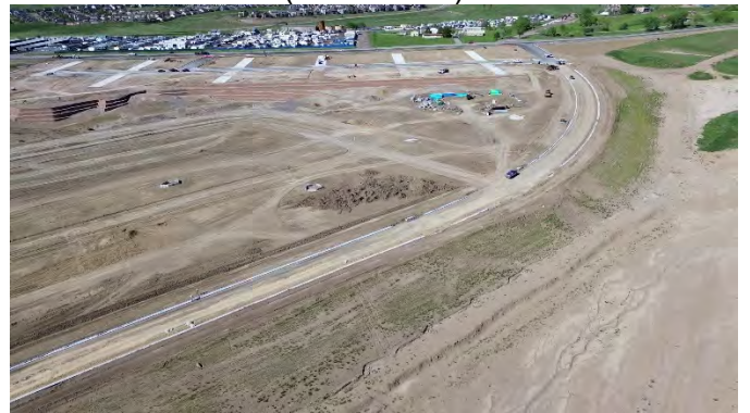
Salvia St. (View: Southwest)