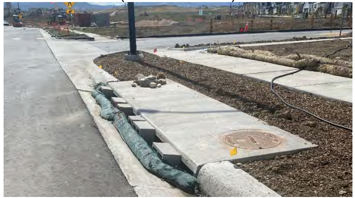
Type R Inlet on 93 rd Ave (View: West)