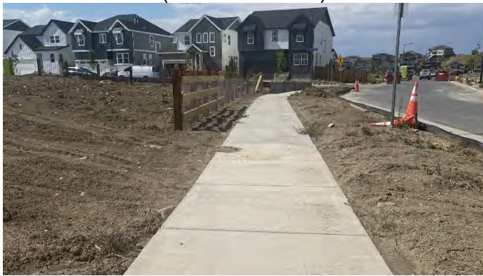
Detached Walk along Quartz St (View: North)