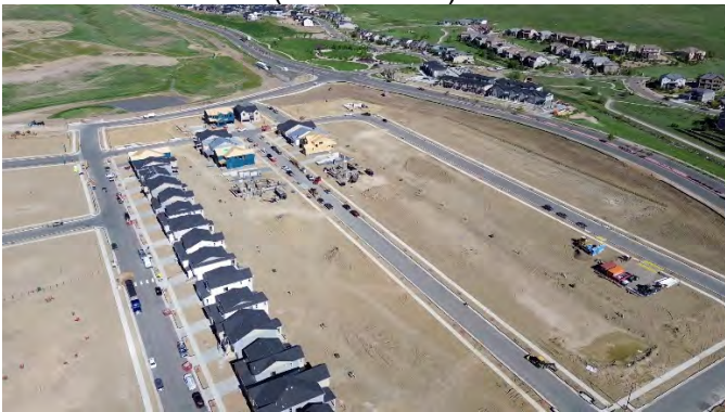
W. 93 rd PL, W. 93 rd Way, & W. 93 rd Ave. (View: Northwest)