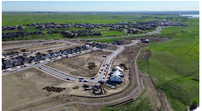
Trailstone W 92 nd Pl (View: Northeast)