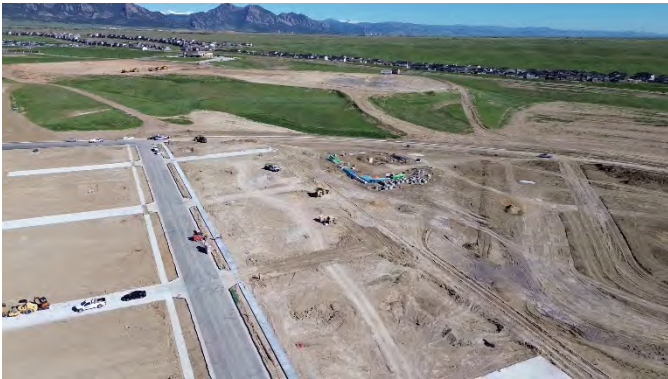
Trailstone Tract I Roads (View: Northwest)